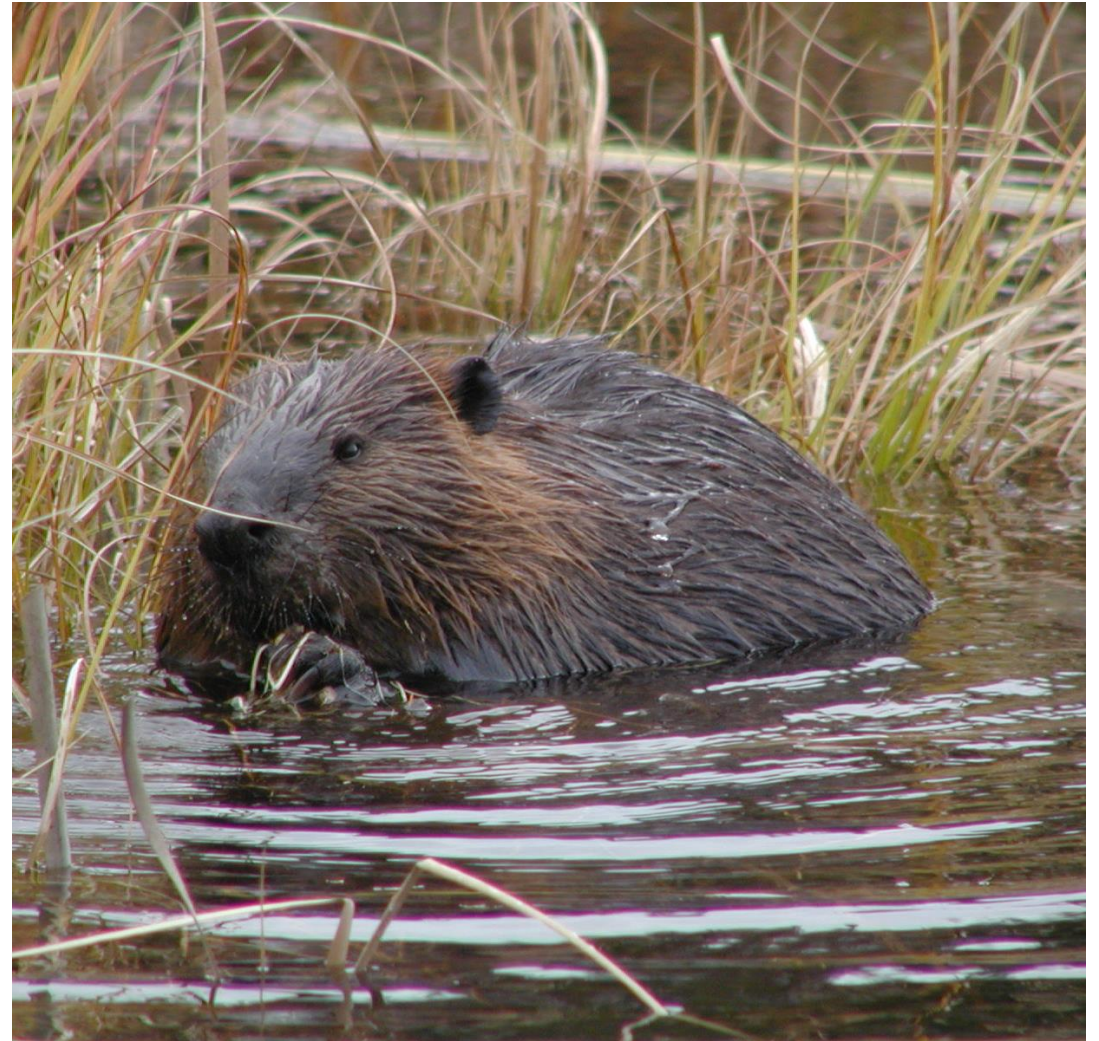
American beaver