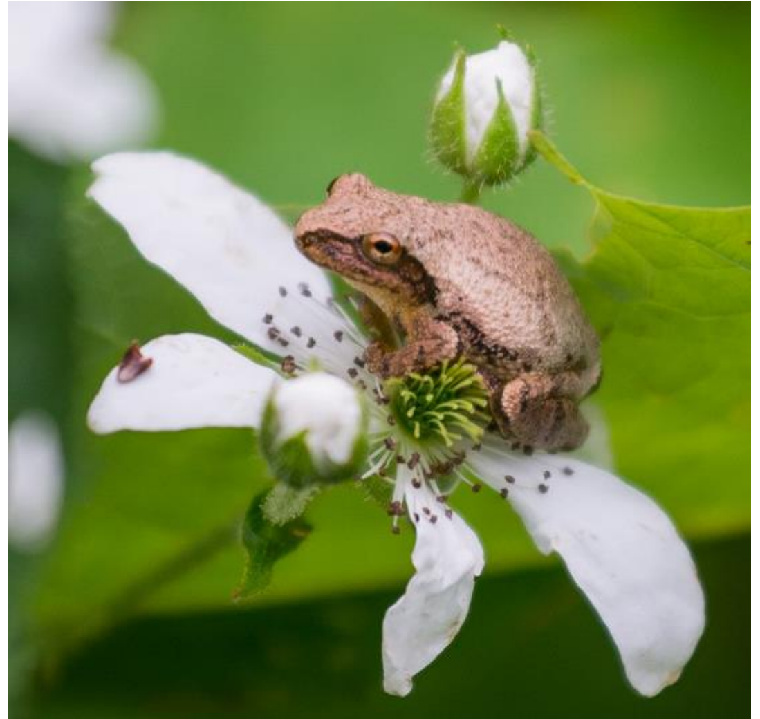
Spring peeper