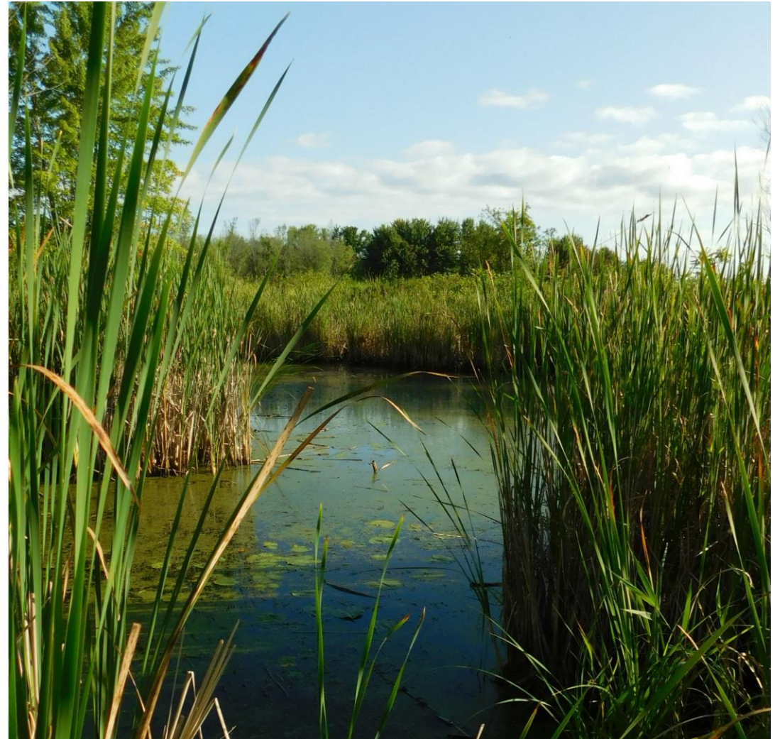
Holland Marsh