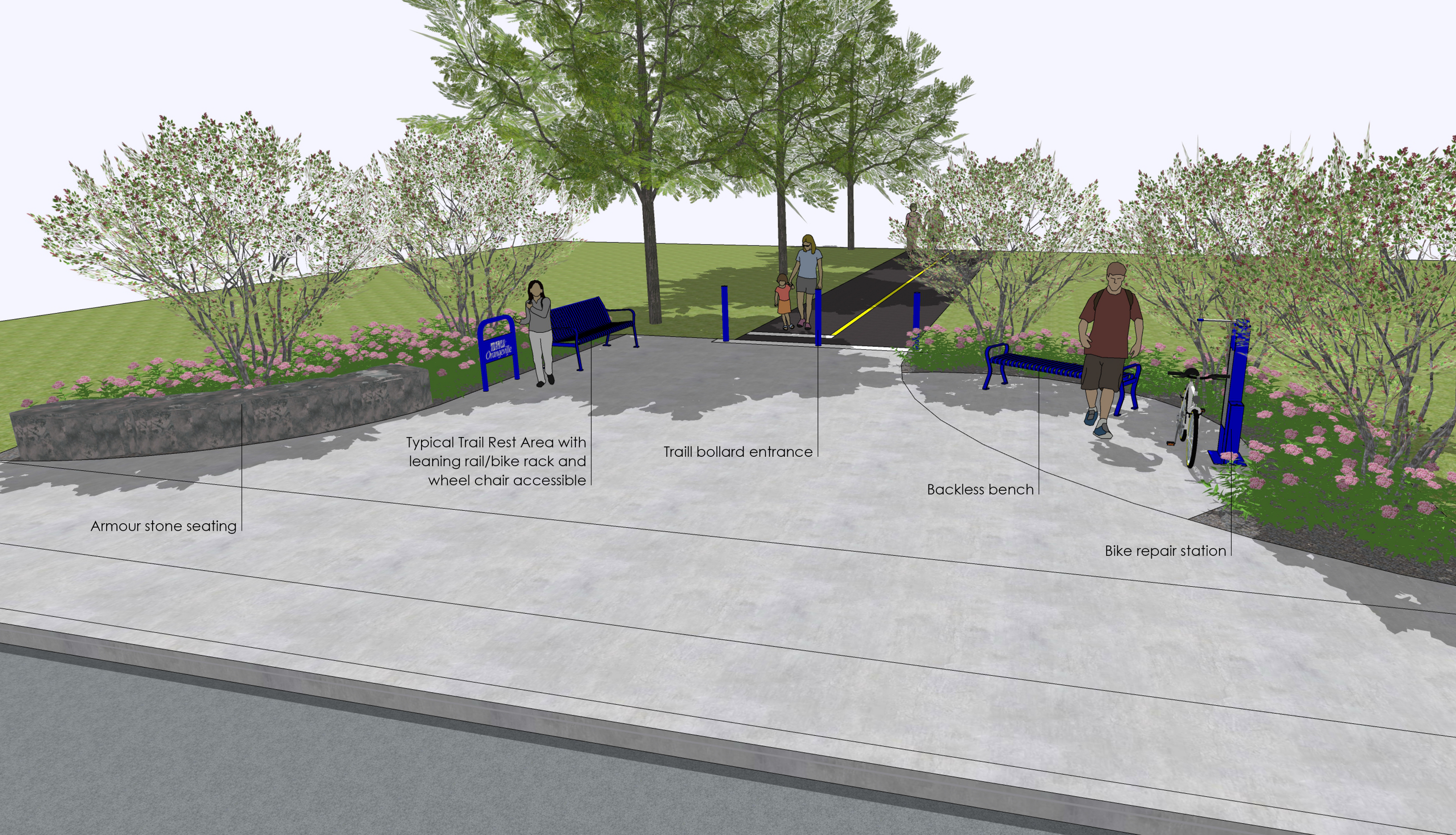
Armour stone seating