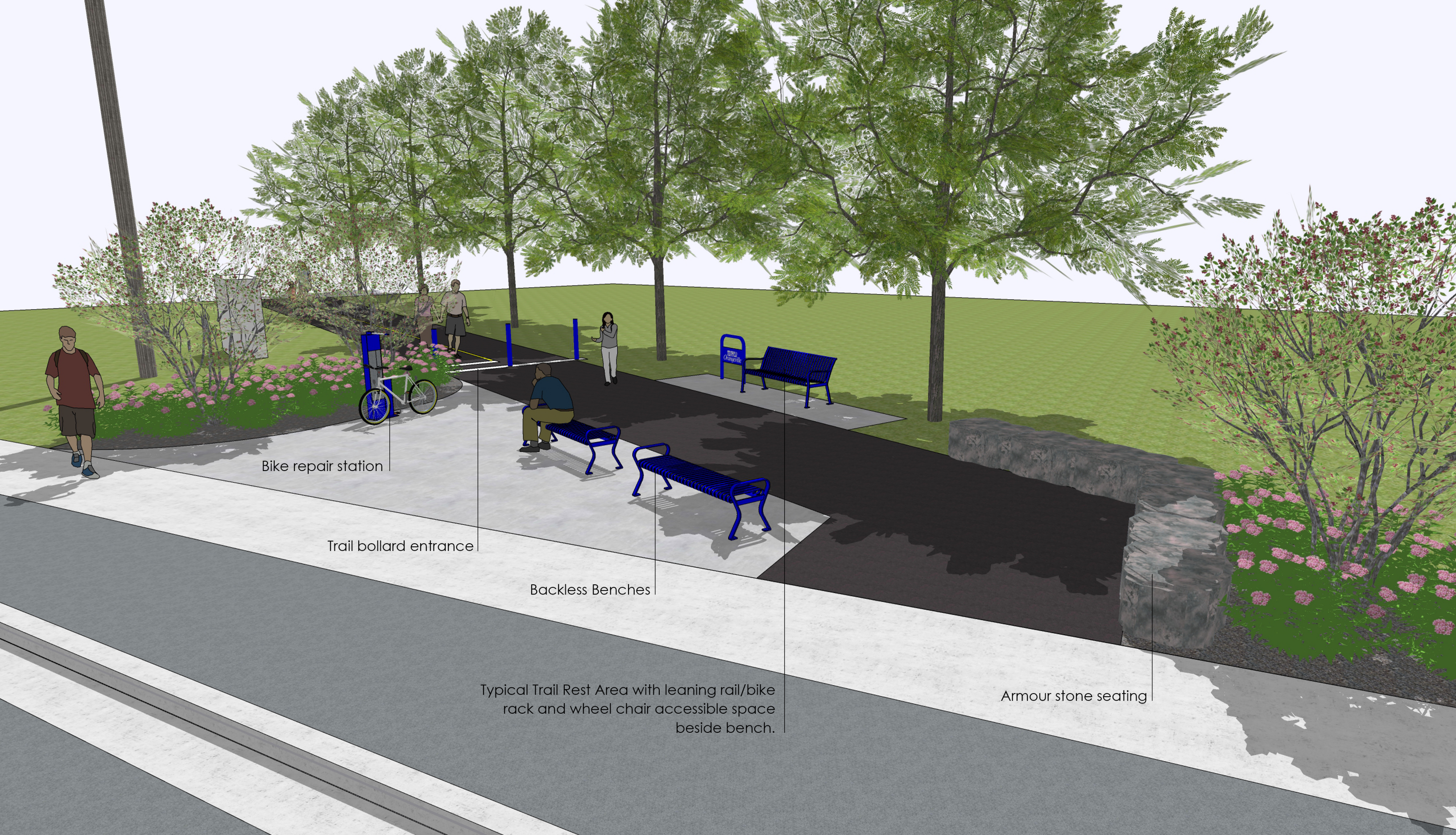
Bike repair station